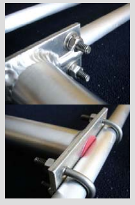
Heavy-duty dipole fixture