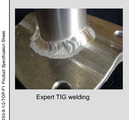
Expert TIG welding